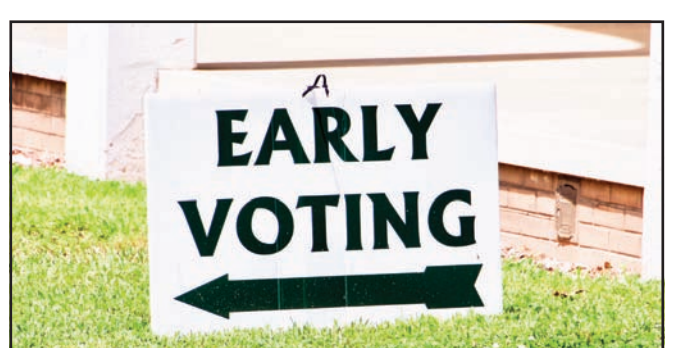
Keep an eye out for this Early Voting sign outside the Towns County Courthouse starting Monday next week.