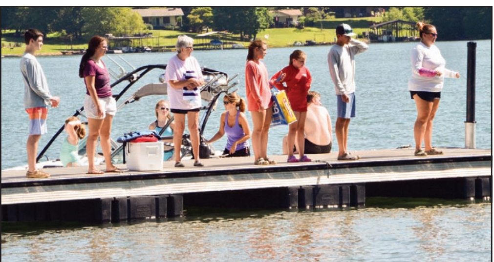
The boat ramp at the Georgia Mountain Fairgrounds was bustling with people having fun in the sun over the weekend.