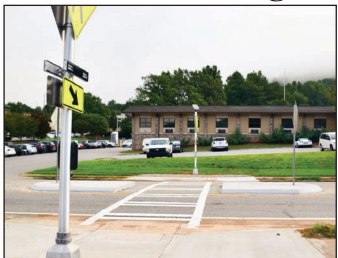
The new GDOT crosswalk at Chatuge Regional Hospital on Main Street was completed Wednesday, July 8.

"Just last year, we had someone who was hit by a car and ended up with some pretty serious head trauma. The hospital has been asking for this crosswalk for many, many years, and it's the responsibility of the council and (the mayor's) office to keep citizens' safety first and foremost."